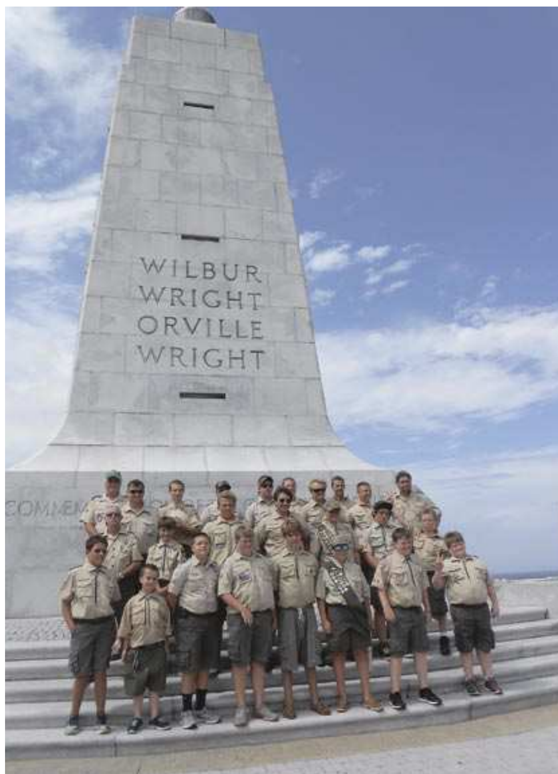
Boy Scout Troop 252 of Davis poses in front of the Wright Brothers National Memorial in Kill Devils Hill. The troop recently took a camping trip to the Outer Banks and visited the Bodie Island Lighthouse and toured the Wright Brothers Museum and monument.