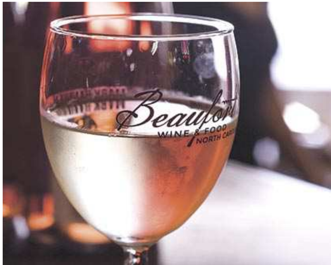
Beaufort Wine & Food will host a Members Appreciation party at noon Saturday, Aug. 15. During the party, recently awarded grants will be reviewed and dates for upcoming events will be announced.

To join, volunteer or become involved with Beaufort Wine & Food, or for more information, call 252-515-0708, go online to www.beaufortwineandfood.com or stop by the Beaufort Wine & Food office at 400 Front St., Suite No. 8.