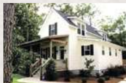
The Beaufort Cottage $258,000 | Move In Now Home 3 beds, 2.5 baths and 1,715 total sq. ft.