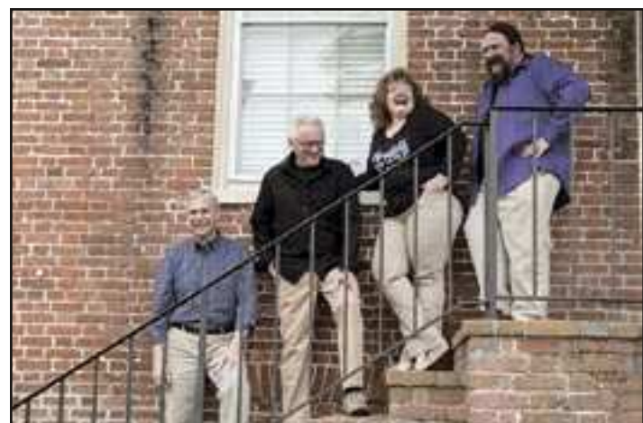
The Bears, New Bern's newest oldies band is scheduled to play at Trent River Coffee Co. starting at 7 p.m. Saturday, Aug. 15.

For more information, call 252-514-2030 or check out www.thebears.band .