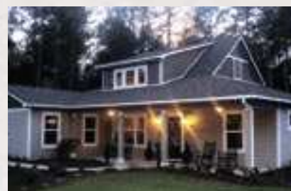
The Meridian Cottage $299,000 | Move In Now Home 3 beds, 2 baths and 1,778 total sq. ft.

If you took all the best things about waterfront living on the Inner Banks and put them in one place, you'd have Arlington Place. Adventures await on the water and on the land. Relaxation is right on your front porch.