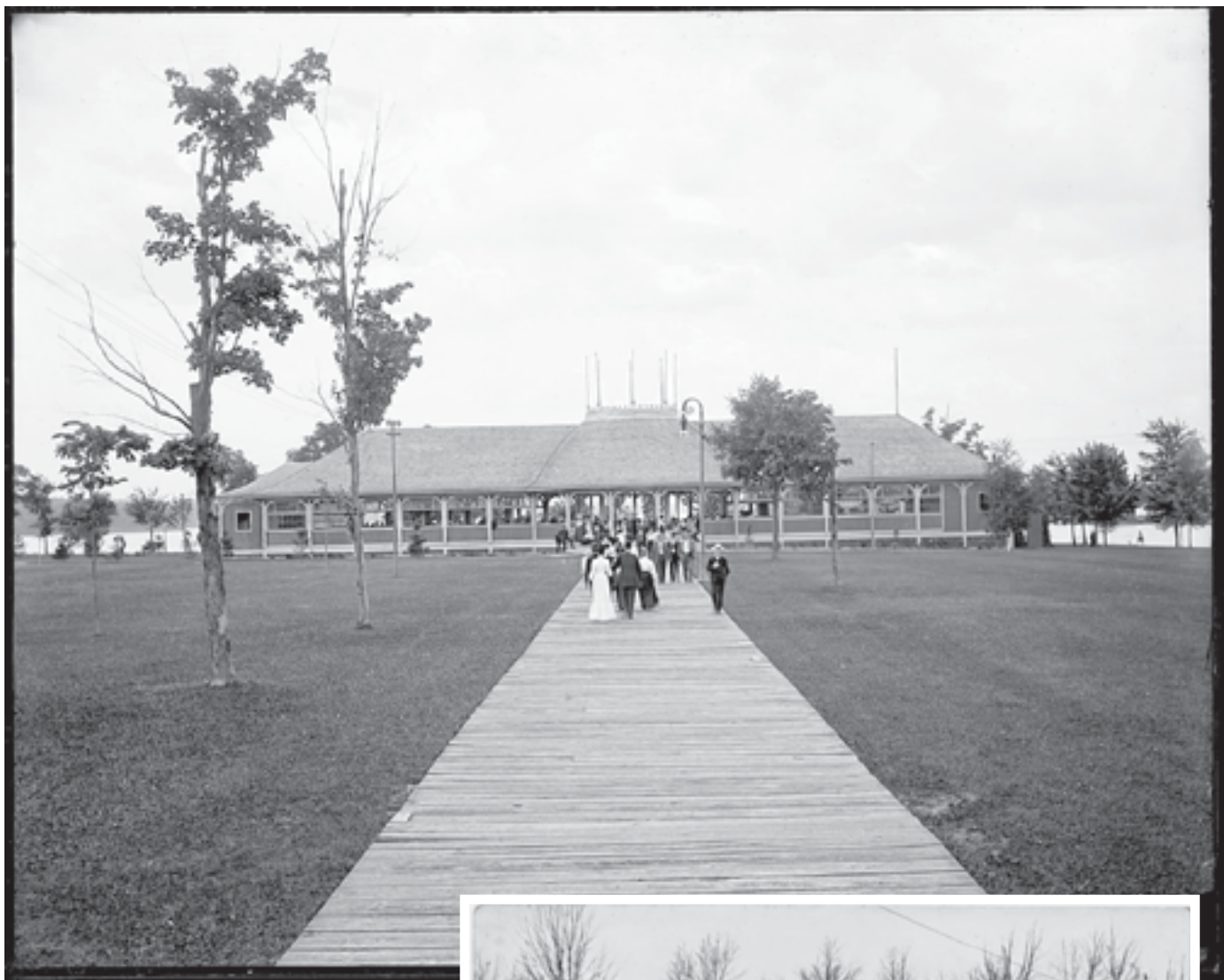
Visitors to Emerson Park would walk from the trolley station “on the boardwalk – (literally)” leading to the Pavilion. At right: the fire in May, 1912, reduced the Pavilion to ashes. However, the new Pavilion reopened in July 1912, just two months after it was destroyed.

The second crucial element to achieve the vision was to develop a new business model for the operation of the facility. The partnership set out to identify a facility operator with the experience, ideas, talent and energy necessary