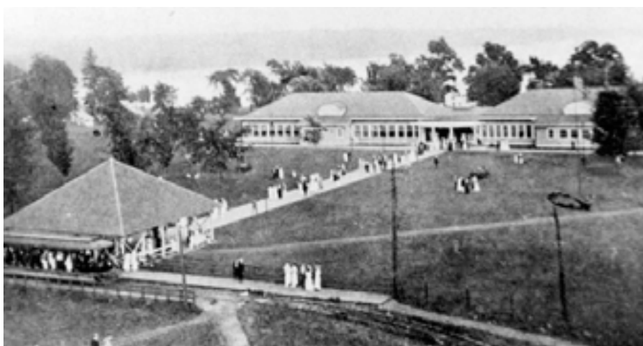
An aerial photograph of the Pavilion (1912-1913)

gatherings with a private deck for outdoor seating and magnificent views to the south and west.