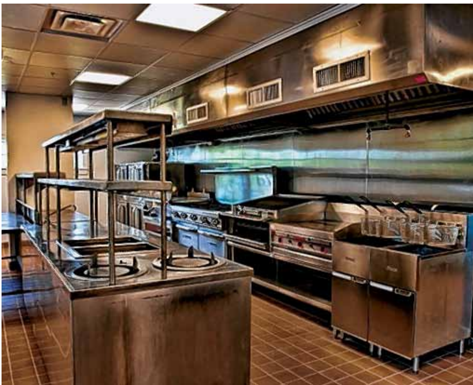
The main kitchen in the newly renovated pavilion