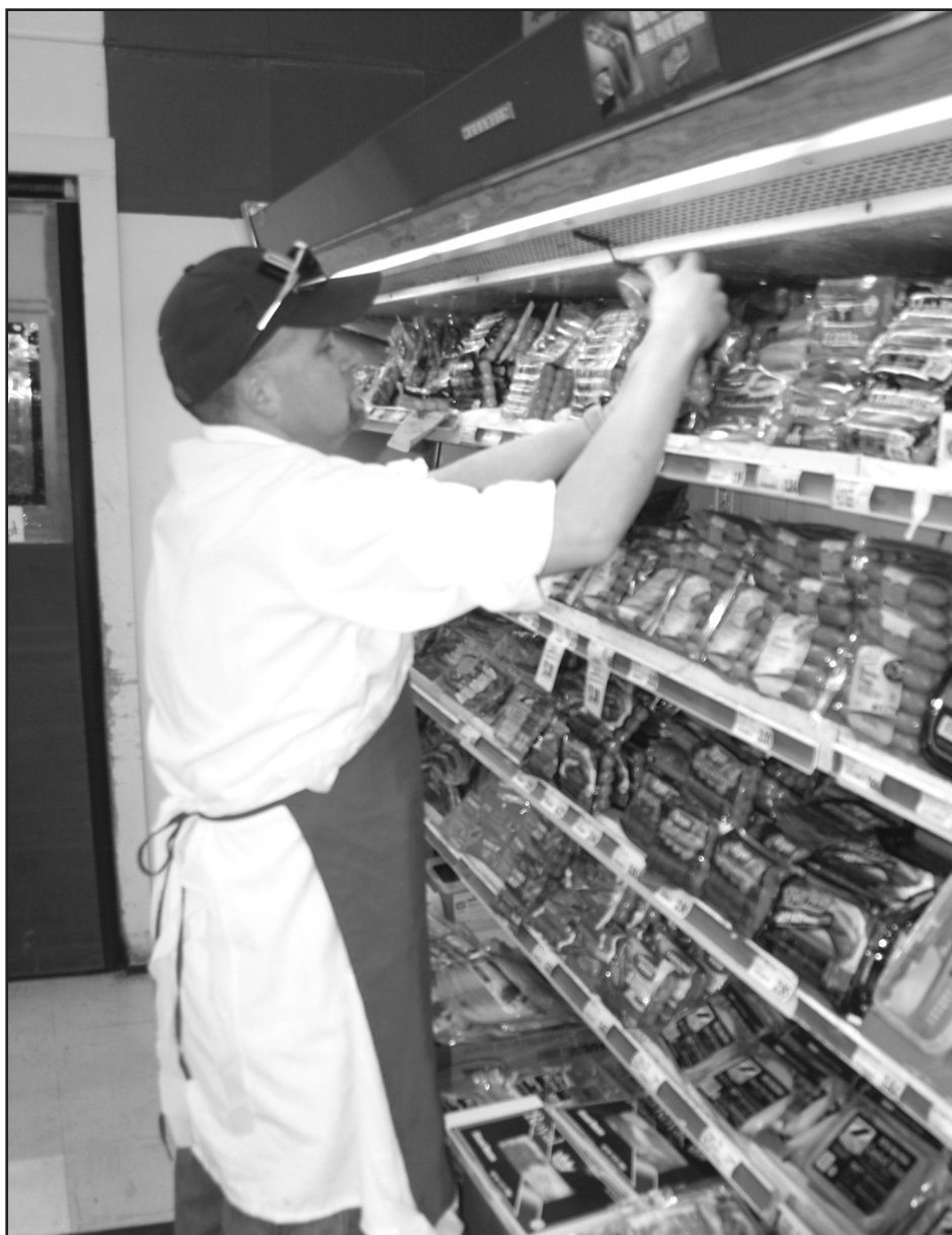
Customers value the knowledge of the employees at Food Outlet, especially in the meat department, where they will cut meat to your specifications.