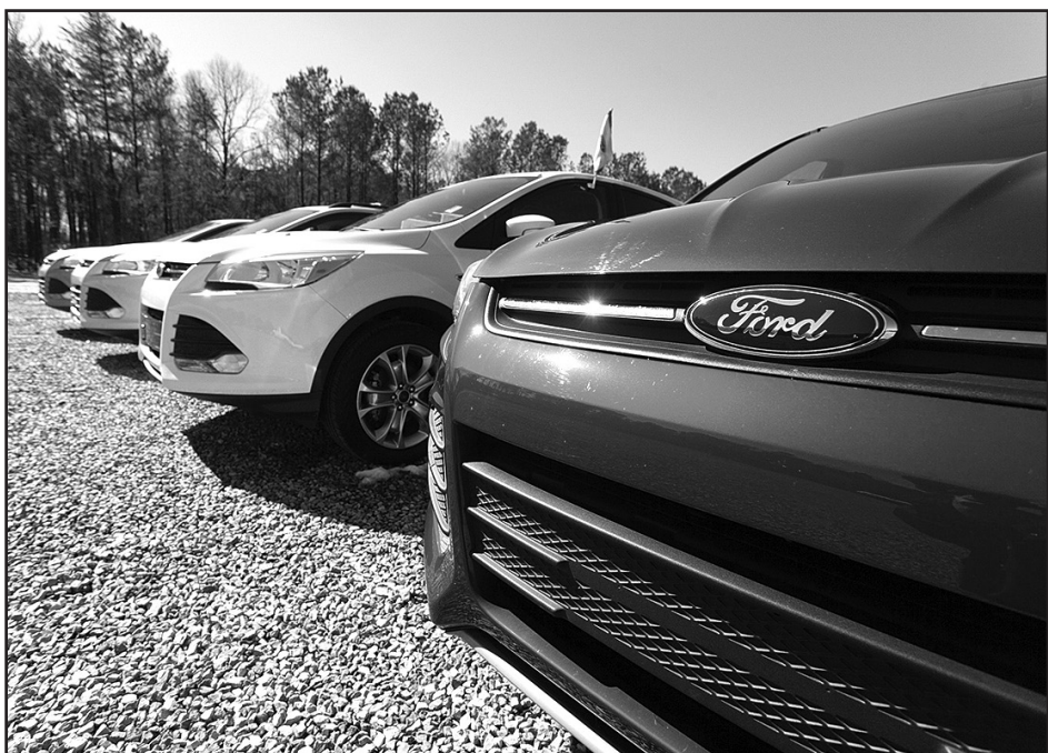
Town and Country Ford has grown tremendously in the past four years, increasing its inventory of new and used vehicles dramatically. The dealership has about 200 new and used vehicles on their lot.