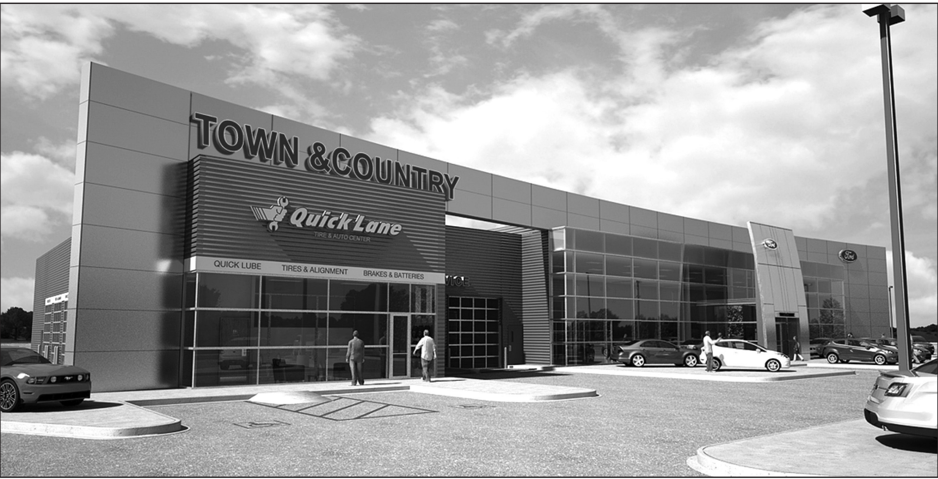
Town and Country Ford is building a state-of-the-art service and sales facility that is environmentally friendly as well as customer friendly.