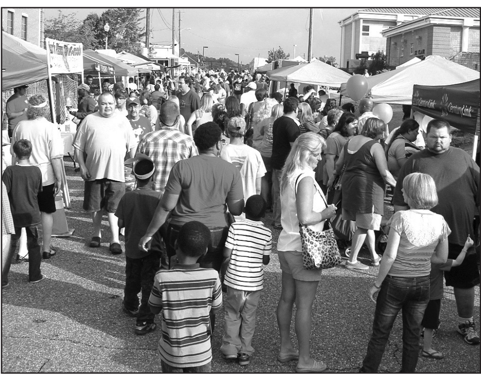
The chamber's annual Block Party is just one event the chamber hosts to attract people to Pell City.

Other events the chamber hosts to promote Pell City include the Annual Chamber Block Party, quarterly Chamber Luncheons, Chamber