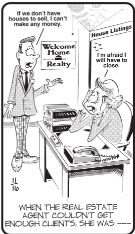
WHEN THE REAL ESTATE AGENT COULDN'T GET ENOUGH CLIENTS, SHE WAS ---

Now arrange the circled letters to form the surprise answer, as suggested by the above cartoon.