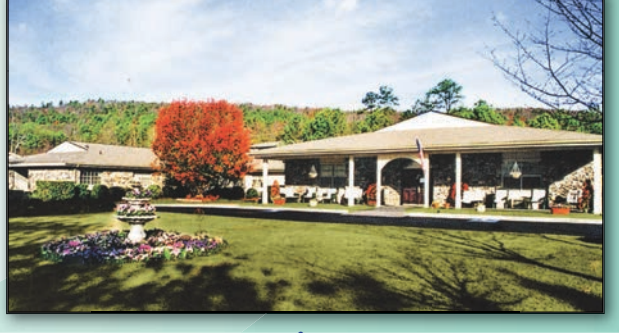
#1 Nursing Home