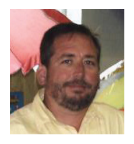
Thank you Calhoun County for voting Pool Doctor the #1 Swimming Pool/Spa Dealer.